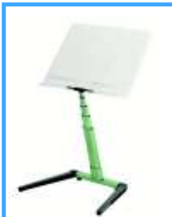
The Jazz stand goes high enough for the trumpeter, yet low enough for the youngest cellist