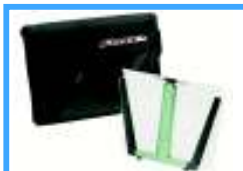
The Jazz stand gig bag holds a jazz stand and, in a separate compartment, your music and accessories