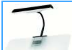
A range of mains and battery powered lights is available for the Jazz stand. See separate leaflet.