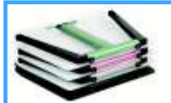
When folded, Jazz stands interlock to form an orderly pile