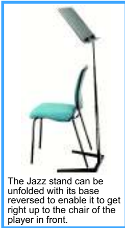
The Jazz stand can be unfolded with its base reversed to enable it to get right up to the chair of the player in front.