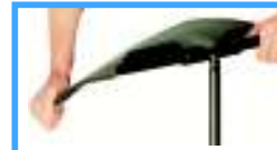
Injection moulded polypropylene tray is virtually unbreakable.