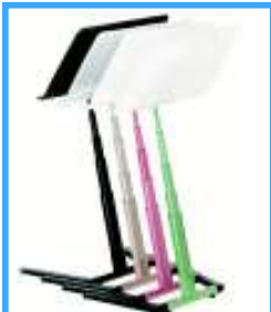
Jazz stands nest next to each other when standing.